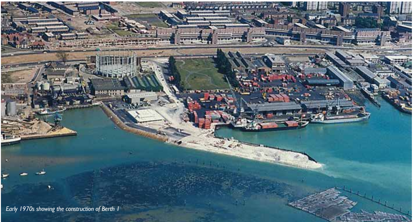
Early 1970s showing the construction of Berth 1

Nearly £34million worth of investment for Portsmouth International Port was announced by Portsmouth City Council.