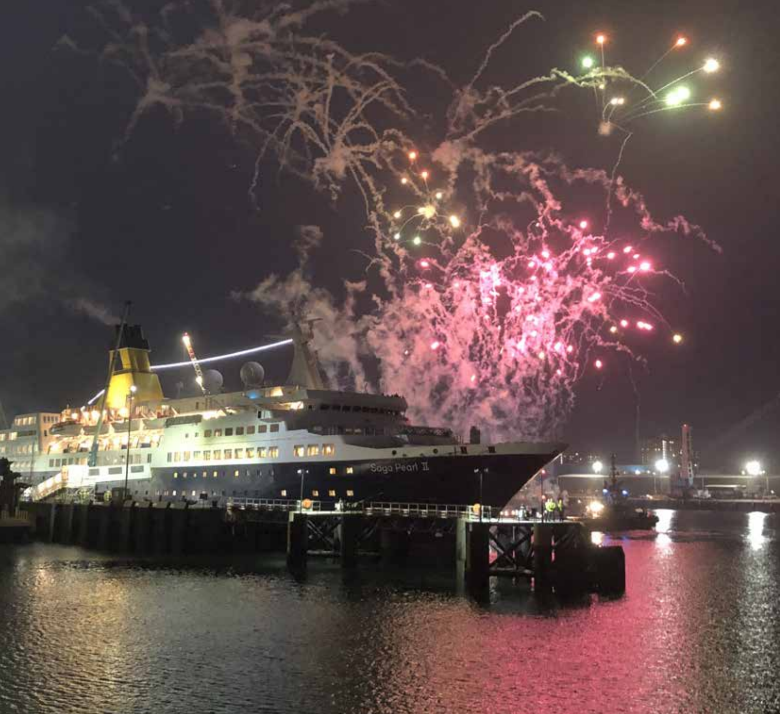
Saga Pearl II departing on her farewell cruise