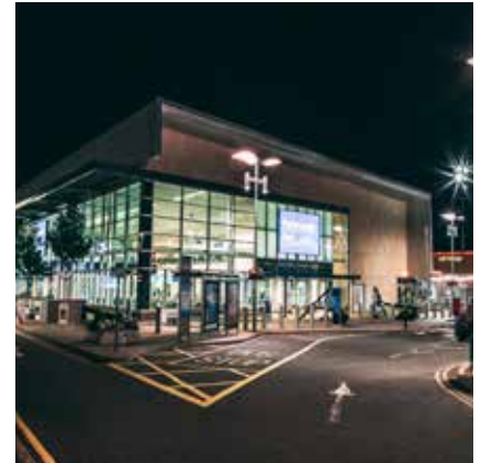
The terminal building at night.

The funding allows essential levelling work to take place on the cruise berth, which once completed means the Port could accommodate cruise ships up to 253m long, and also improve passenger access from the quay to the ship. Work will also include changes to the current terminal building, including a new baggage hall, which will allow them to handle cruise and ferry passengers more efficiently.