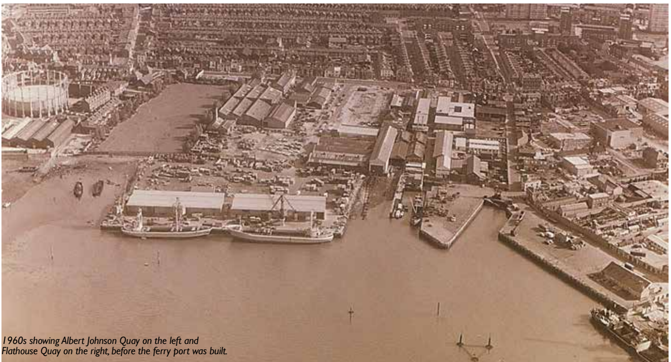
1960s showing Albert Johnson Quay on the left and Flathouse Quay on the right, before the ferry port was built.

For roll-on, roll-off freight, the Port's convenient location on the UK motorway network, and destinations that cut down on driving in France and Spain, Portsmouth International Port is a popular choice with hauliers, logistics